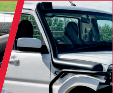
• FIBREGLOSS SNORKELS