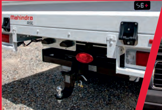
• TOW BAR