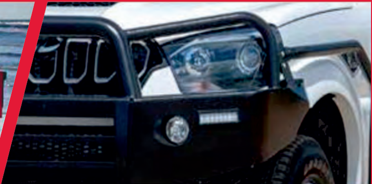
• WINCH COMPATIBLE STEEL BULL BAR AND OPTIONAL BRUSH RAILS