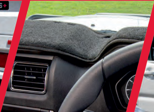
• DASH MAT