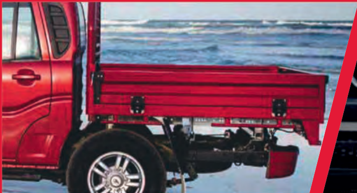
• ALUMINIUM TRAYS, GALVANISED STEEL TRAYS, COLOUR CODED STEEL TRAYS